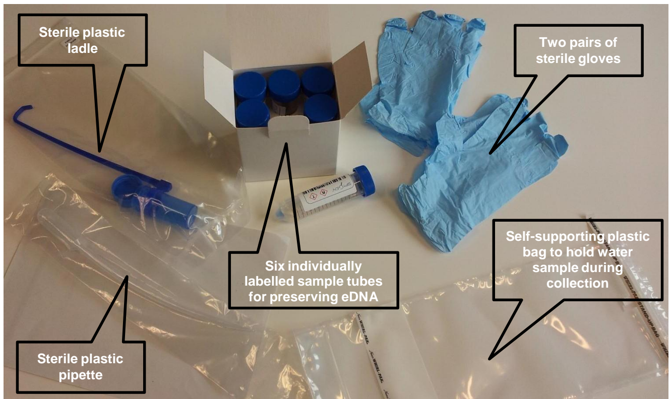
Figure 2 Sampling equipment used for eDNA water samples by Biggs et al. (2014)